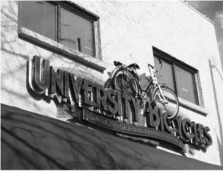
figure 3: Boulder CO 2015.

A wine store (figure 4) might simply show a bottle of wine (denotation: we sell wine ) or they might include elements such as wine casks in the shape of a grape clusters (connotation: we have a playful attitude toward wine; you don't need to be a wine connoisseur to shop here ).