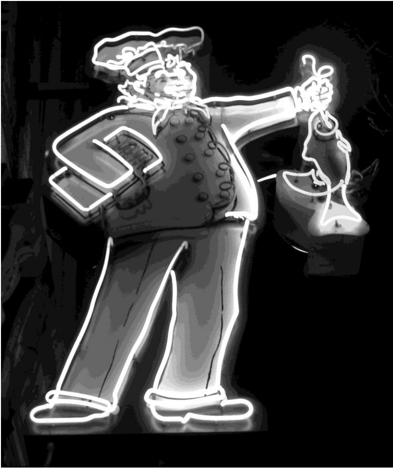
figure 2: Seattle WA 2015.