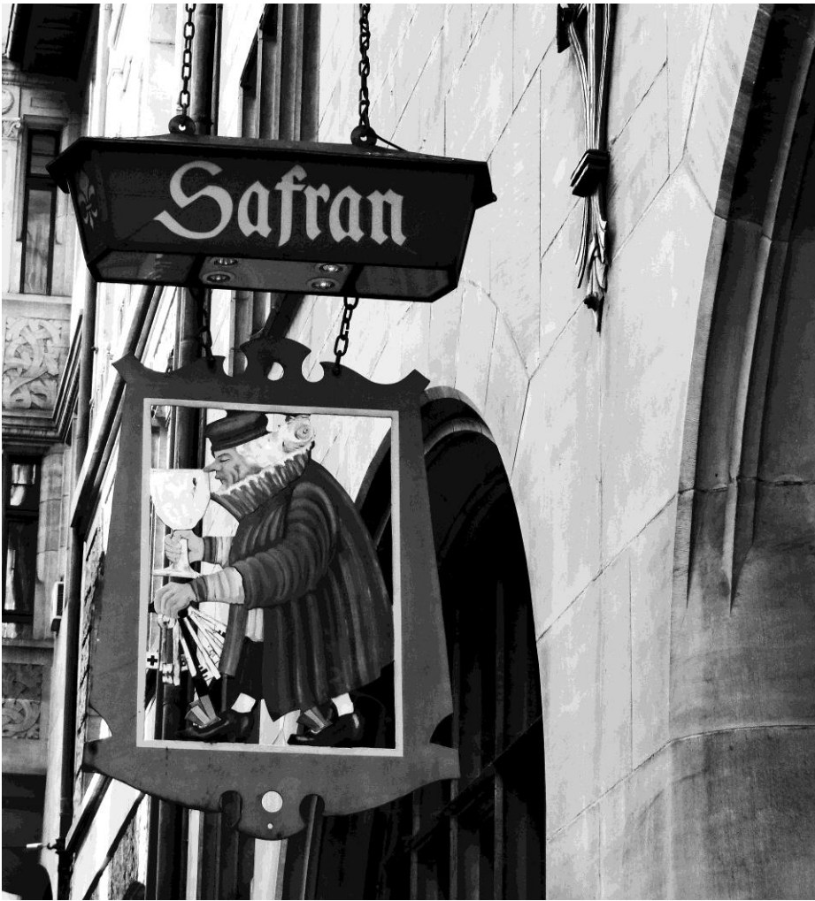
figure 1: Rouen, France 2012.

A fish restaurant (figure 2) might have merely shown an image of a fish (denotation: we serve fish ), or they might instead choose content that tells a story by using an animated neon image that shows chef holding a flapping fish (connotation: everything we serve has 'catch-of-the-day' freshness ).