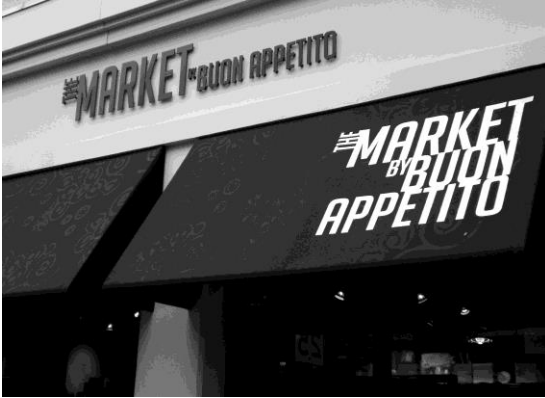
figure 6: San Diego 2014.