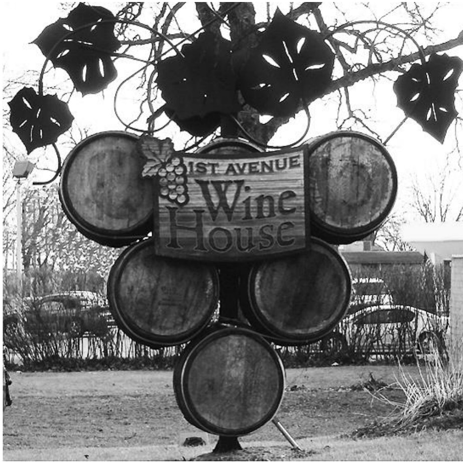
figure 4: Cedar Rapids IA 2017.

Dada (figure 5) promises an unconventional experience through its selection of elements for the storefront. The inclusion of disconnected letters, distorted faces, and neon sign seem to be intentionally at odds with each other (connotation: our product line appeals to an alternative audience. )