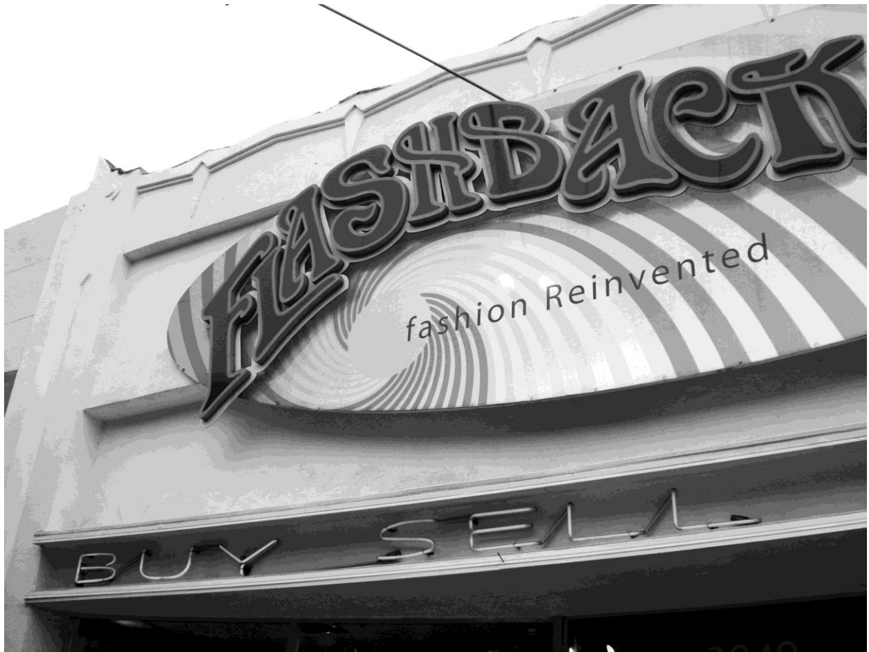
figure 8: San Diego 2014.