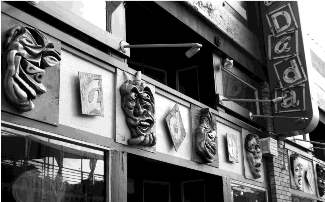
figure 5: Dallas TX 2009.