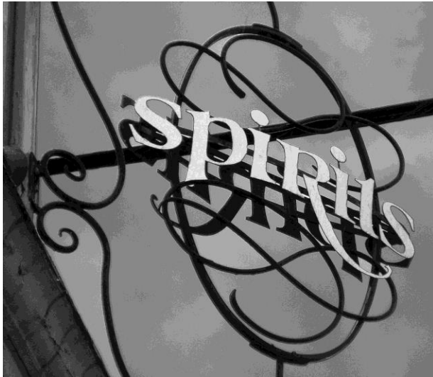
figure 9: Dublin, Ireland 2015.