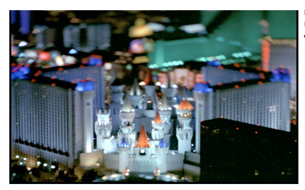
From site specific_LAS VEGAS 05 by Olivo Barbieri, courtesy Yancey Richardson Gallery, New York

These visuals set an absolute focus on the accentuatedly artificial and spectacular. Only a minimal portion of the overall image is crisply defined in these panoramic views. The rest is blurred by means of selective focusing (see Figure 5). This kind of vision corresponds to that of the human eye, which can only put a part of the field of vision into focus. Still and movie cameras are instead capable of presenting the entire image of an urban landscape in homogeneous focus. Barbieri uses the tilt-shift technique, which adjusts the position of the lens with respect to the image plane and also results in partial blurring.