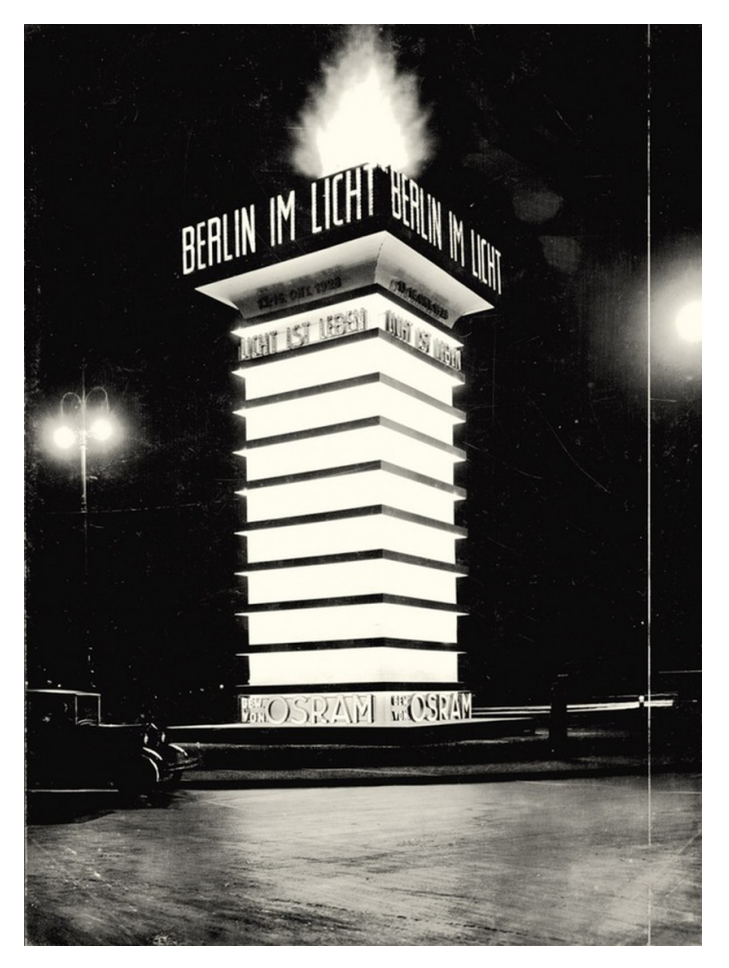
Figure 1 Siegessaeule (Berlin Victory Column)

This film championed an abstract black and white animated form that foregrounded rhythmic and compositional patterns in the tradition of Viking Eggeling's Diagonal-Symphony from 1925. Deslaw's structuring principles are diagonal layering and mirroring techniques to simulate space and to demonstrate that at night, light mobilizes all things in space (see Figure 2). Modern entertainment forms that mirror the mechanically determined speed of the