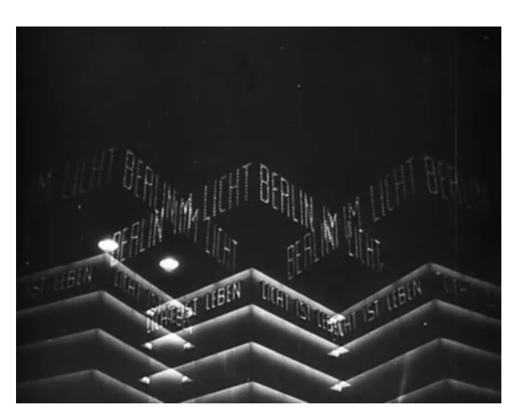
Figure 2 Berlin in Light (Berlin im Licht), Light is life (Licht ist Leben)

From Les Nuits Électriques by Eugene Deslaw, 1928, during the Berlin in Light week in October 1928