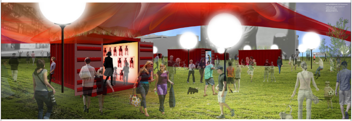
THE URBAN LIVING ROOM ON 100 SOUTH AND MAIN STREET - AN URBAN ART LAB PROPOSAL