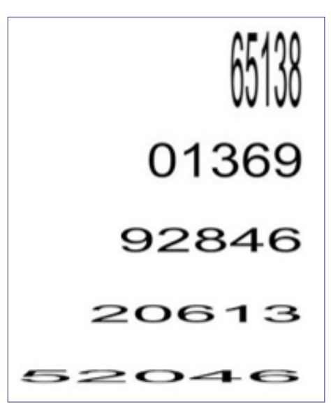
Figure 1 / Character aspect ratios investigated in the legibility study. From top to bottom, aspect ratios (height/width) are 5.25, 1.26, 0.78, 0.46, and 0.26.

Each participant made 100 identification trials. With five aspect ratios and two contrast levels, there were 10 experimental conditions, and participants experienced 10 trials for each condition. All trials and conditions were presented in a randomized order.