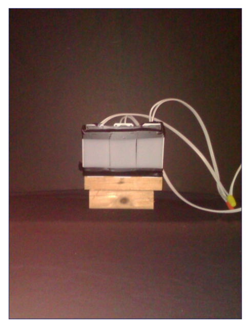
Figure 1 / Scale model display used in the experiment.

the same illuminance at the eyes. In other words, a checkerboard pattern might be expected to be judged as more glaring than a uniformly gray sign with the same average luminance. If this finding can be extended to signs, quantifying the illuminance alone from a sign might not be sufficient to avoid problems.