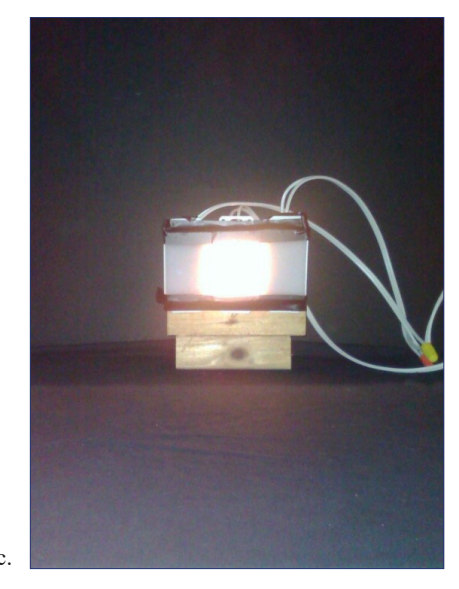
Figure 2 / a: Display with all panels at 333 cd/m<sup>2</sup>. b: Display with outer panels at 500 cd/m<sup>2</sup>. c: Display with center panel at 1000 cd/m<sup>2</sup>.