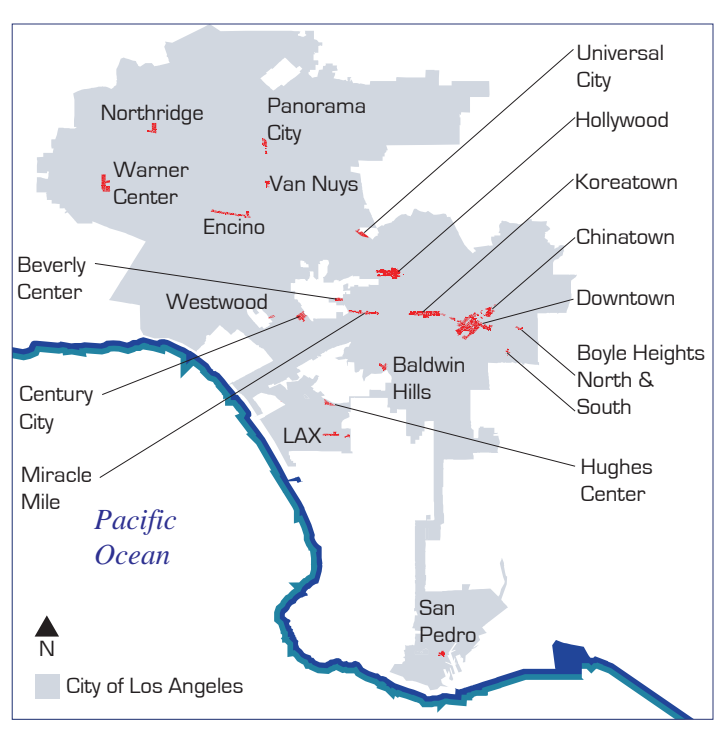
Figure 3 / Proposed and Existing Sign Districts of Los Angeles, 2019.

New technologies are also leading to increasingly immersive interactive environments that allow new kinds of engagement between consumers and digital media. A notable example involved the use of digital signage to alert passersby of the origin of arriving planes into London Heathrow Airport (Klaassen, 2014). On the ground, outdoor advertising will increasingly serve as a point of sale for marketers, allowing mobile-