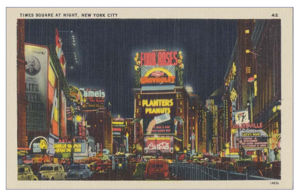
Figure 2 / Times Square, about 1940, Vintage Postcard.

in Times Square (Charyn, 1986). Signs of all shapes and sizes soon covered the area as the intersection of major automobile thoroughfares was transformed from an indistinct series of non-architectural spaces into one of the most powerful images of urban habitat in the world (Huxtable, 1991). Signage became architecture in the bustling entertainment district of New York City as billboards of all shapes and sizes signaled the opportunity for a truly unique metropolitan experience (Tell, 2007). As seen in Figure 2, billboards were trompe l'oeil in this space, extending the constant activity of cars and people on the street using colorful and vibrant advertisements to visually extend the action onto the façades of the buildings, day and night.