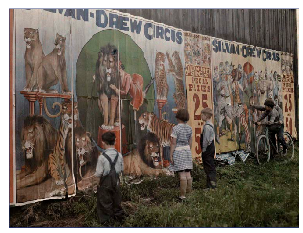
Figure 1 / Circus Billboard, 1931