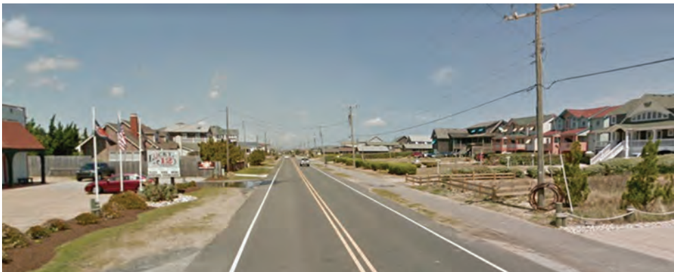
Figure 1 / North Carolina Highway 12, looking northbound

1. North Carolina Highway 12 (NC 12 / South Virginia Dare Trail) is a two-way, two-lane primary highway with a posted speed limit of 35 mph. 10-foot wide travel lanes are separated by a solid double yellow no passing centerline. NC 12 has solid white edge lines and 3.5-foot wide shoulders (see Figure 1).