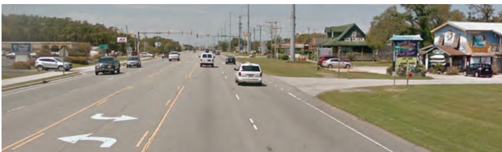
Figure 2 / United States Route 158, looking northbound

2. United States Route 158 (US 158 / South Croatan Highway) is a two-way, five-lane undivided arterial highway with a center turn lane. It has a posted speed limit of 45 mph, 11-foot travel lane widths, and similar to NC 12 has solid white edge lines and 3.5-foot wide shoulders (see Figure 2).