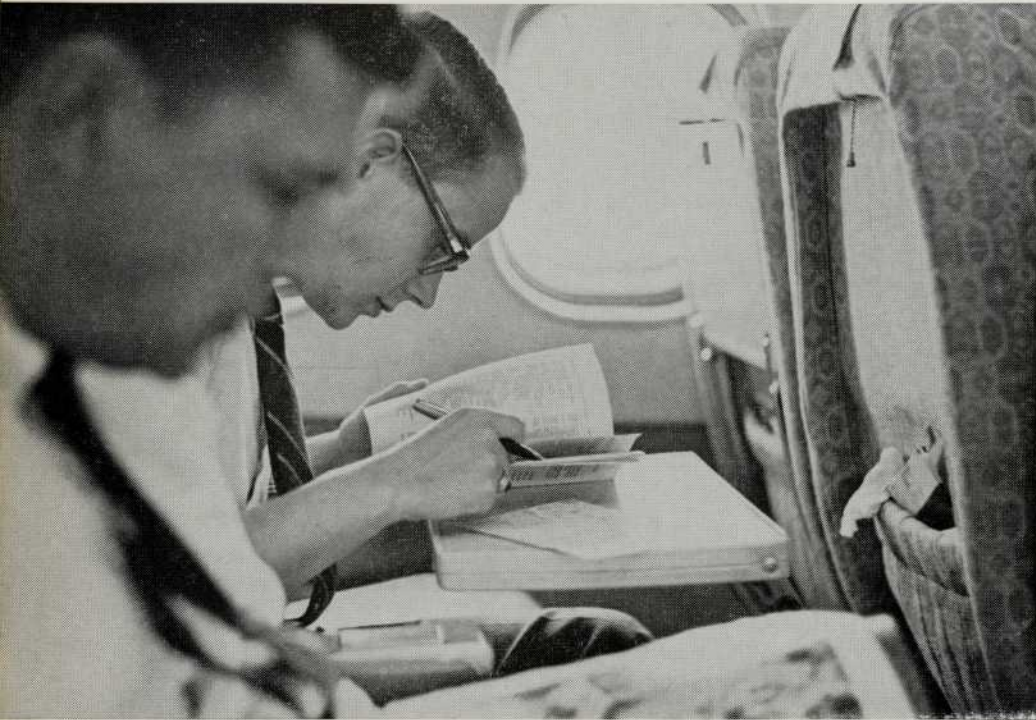
Poring over reference book on jet to New York