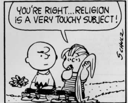
Cartoon copyright by United Feature Syndicate, Inc. Used by permission. From The Gospel According to Peanuts , M. E. Bratcher 1965

Peanuts Comes to OU Good Grief! Another provocative COR!