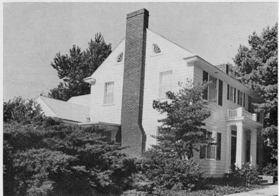
President-Designate's Home, Temporarily Until a new President's Home is built

A vast collection of papers, photographs, and documents of the late Gen. Patrick J. Hurley are ready for use by researchers. The collection, housed in the division of manuscripts in Bizzell Memorial Library, was given to the University by Hurley's widow, Continued on page 26