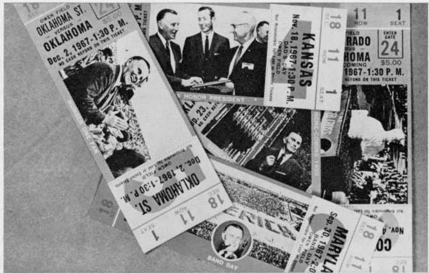
The 1967 Home Football Game Tickets Honoring a good friend

And for the obligatory grading system: Twenty correct is perfect, thus an A; 18-19 is a B; 16-17 is C; 14-15 is D; 13 and below is a Fox. If the grades are low, we might go to a curve; or for an extra assignment to bring your grade up, you might suggest some names-to-forget for these buildings: Pharmacy Building, Drama Building in the