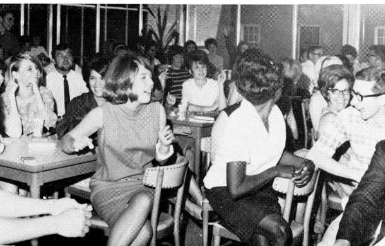
big crowd at small college

For two trimesters students participate in a program called Contemporary Man in World Society, a three-hour course that is carefully structured to relate to other courses in mathematics, science, English and language. From there the core program goes to Principal Ideas of