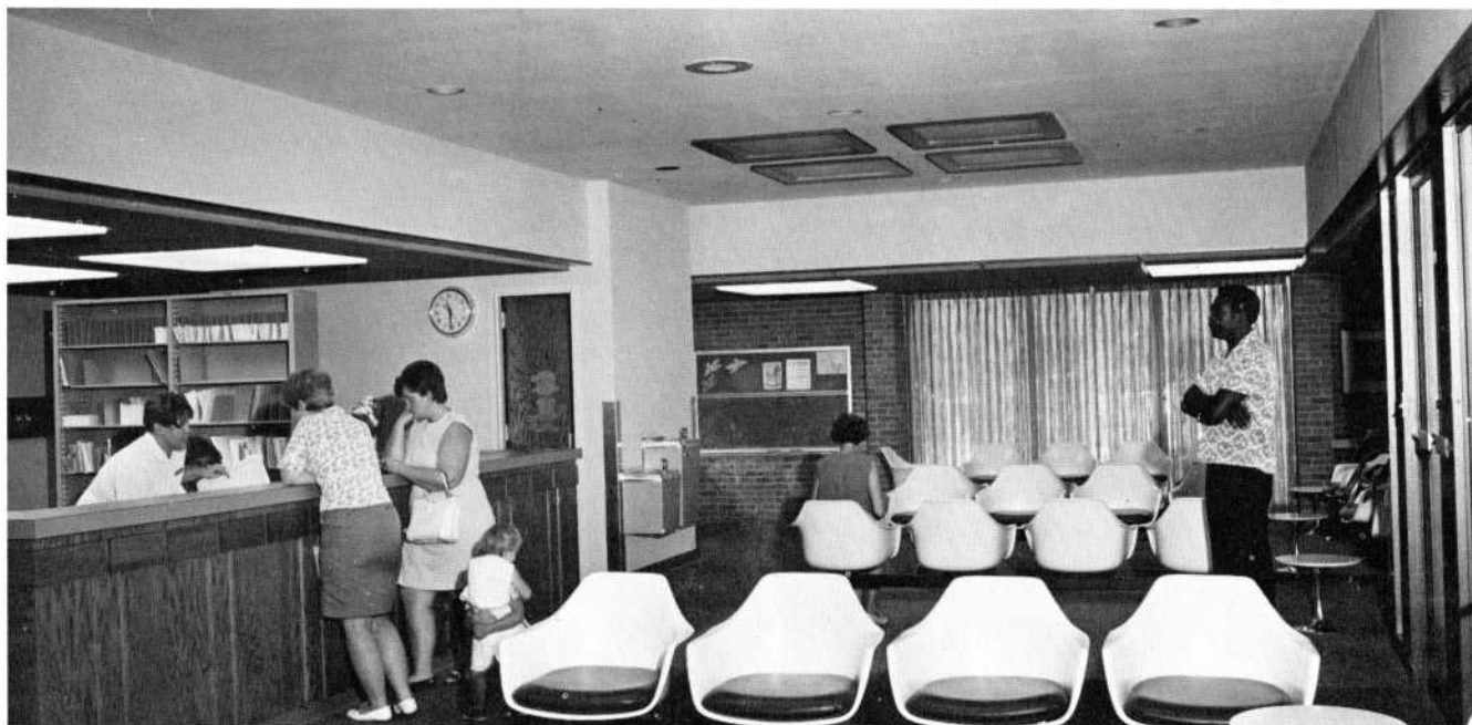
Home base for the Medical Center's pioneering program in family practice is this new Family Medicine Clinic.

Additions within the past two years were the Family Medicine Clinic, a $144,793 structure designed as a model private clinician's office; the School of Health, currently located in a row of former homes in