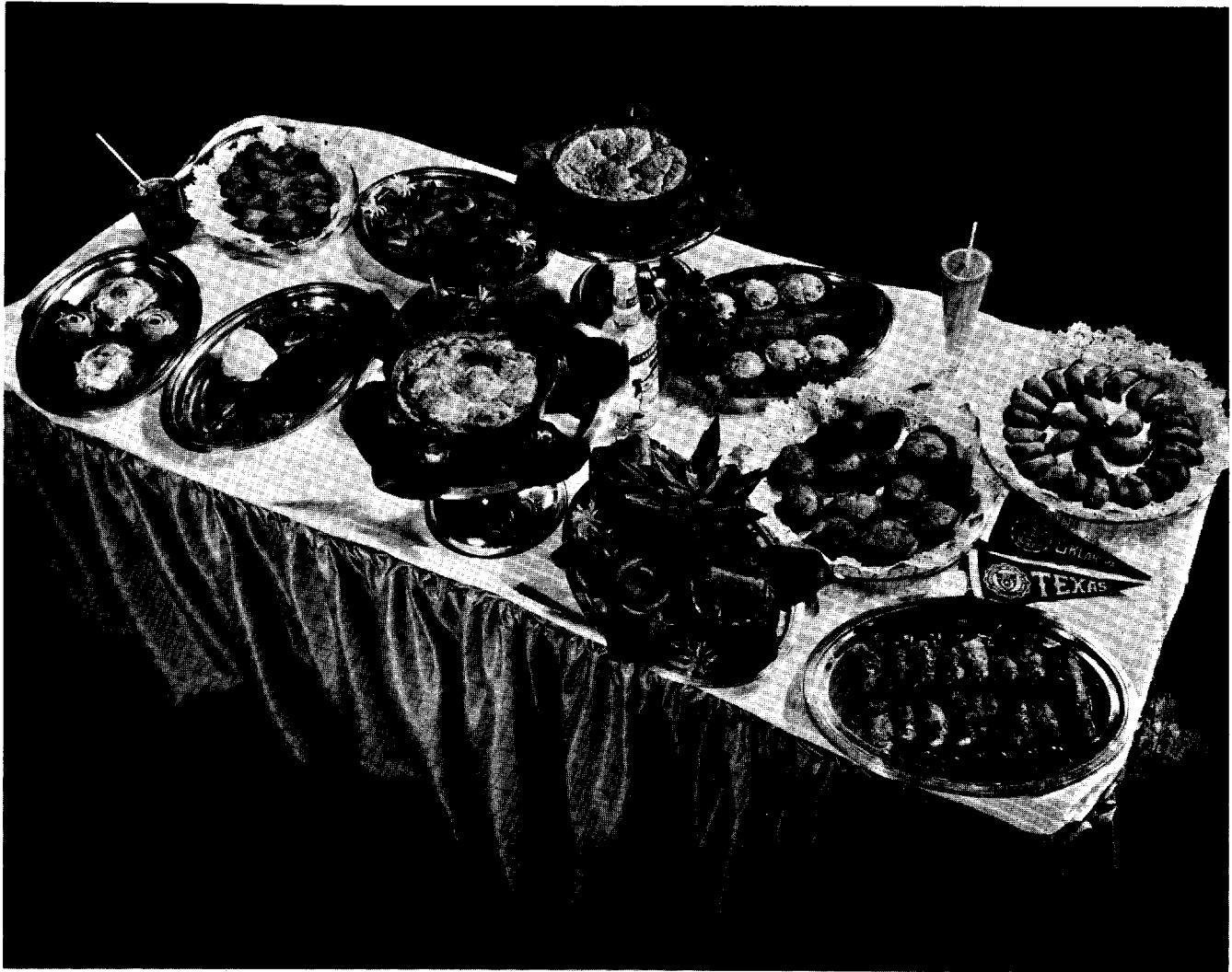
Before the serious eating began this is how the OU-Texas spread looked