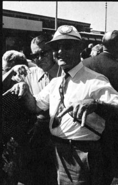
The University of Oklahoma Association chartered three buses to the annual OU-Texas Game. Each was filled to capacity. Many Sooners who drove to Dallas waited at the Marriott and boarded buses to the game in order to avoid the Cotton Bowl traffic.