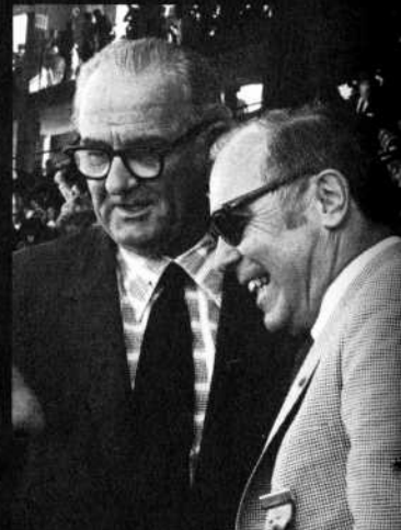
Before the rout — Big Red prepares to take the bull by the horns.