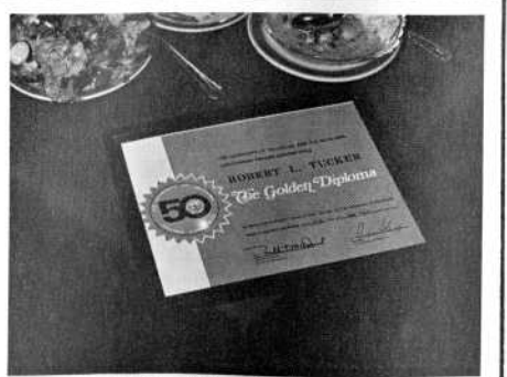
Every graduate of the class of 1922 received a Golden Diploma recognizing his 50 years as an alumnus and many years of service to the University of Oklahoma.