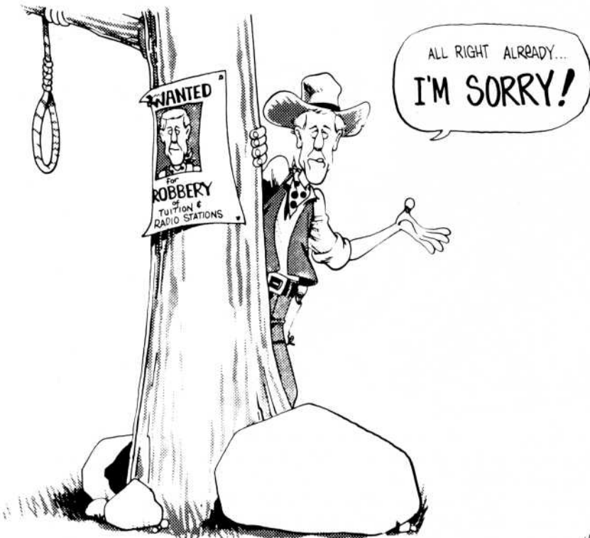
For the local market, Hill had to develop a good caricature of the OU president. He was pleased with the Bill Banowsky above trying to make amends for recommending the new tuition hike and for changing KGOU's rock 'n roll format.