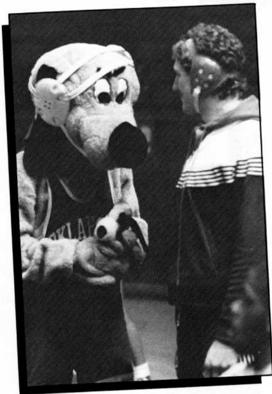
When not busy stirring up the crowd or advising the referee, Underdog finds time to offer some coaching tips to Oklahoma Sooner wrestlers.