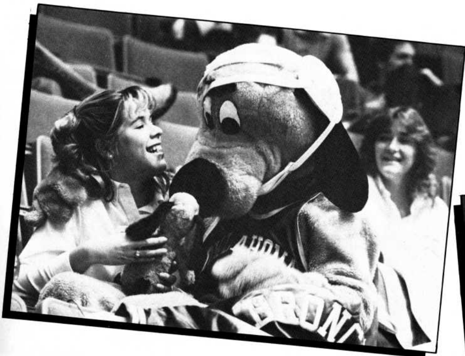
Always popular with the ladies, Underdog and sidekick Underpuppy perch happily on the lap of a startled spectator at a Sooner wrestling match.