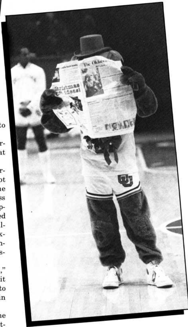
Top Daug, reading a newspaper and shouting "Who cares?" after each player's name, leads the student section in demonstrating boredom with the introduction of the visiting team.

at home, the mascots find plenty of hostility when they visit foreign arenas.