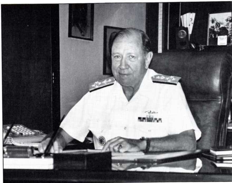
By ADMIRAL WILLIAM J. CROWE JR. Commander in Chief, U.S. Pacific Command

It is a genuine privilege to contribute to Sooner Magazine . Little did I imagine when I entered OU in the fall of 1942 that I would one day grace the cover of its alumni publication. (I'm sure my teachers and classmates share this amazement!) I entered the U.S. Naval Academy one year later and have been following the flag ever since. It's been 42 years, yet I have never lost my affection for Oklahoma, its people or its way of life.