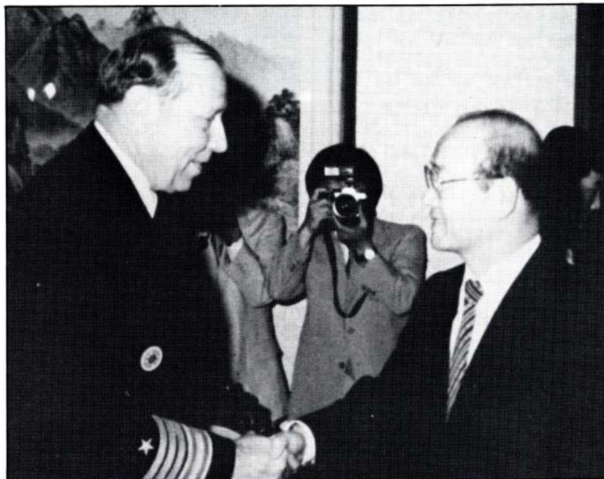
On his first official visit to the Republic of Korea as U.S. Pacific Commander in Chief, Admiral Crowe met last fall in Seoul with President Chun Du Hwan.

Our forward deployed strategy has served both the United States and its allies well. But in the face of determined Soviet military expansion, we must not underestimate the task ahead. The increasing threat and the years of neglect that plagued our military establishment in the wake of the Vietnam war took a painful toll of our capabilities. Recent improvements notwithstanding, it will be several years before the current modernization programs are completed and our major deficiencies corrected. The administration has mapped out a long-term program for restoring the margin of confidence which we require to counter the expanding Soviet