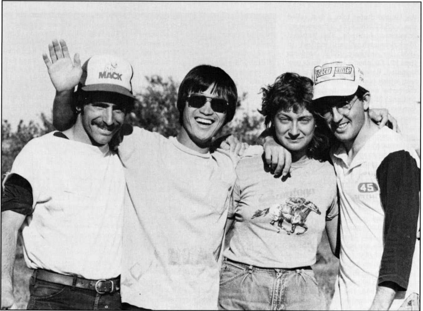
OU Peace Corps trainees in fisheries, Class of '84, prepare to take their expertise to a world that needs their help.