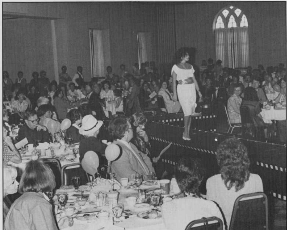
Even a few fathers could be seen in the crowd at the Mom's Day luncheon in the Oklahoma Memorial Union Ballroom. Highlight of the event was provided by the fashion design students from the School of Human Development who staged a style show featuring their own creations.