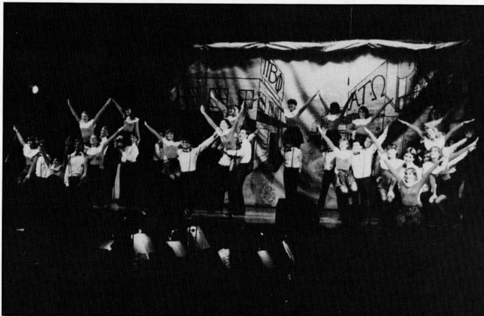
Moms' weekend wouldn't have been complete without attending a performance of "A Dream Come True," this year's version of "Sooner Scandals." The Pi Beta Phi/Alpha Tau Omega entry, pictured above, placed second behind the best-in-show winner, Delta Delta Delta/Lambda Chi Alpha, with third place going to the members of The Pride of Oklahoma, making their first appearance in the annual extravaganza. First place in the small act category went to Alpha Gamma Delta/Delta Upsilon, with Gamma Phi Beta/Sigma Phi Epsilon taking second.

sports minded, you could hardly throw a cat on campus that weekend without hitting a spring sporting event. On the diamond at L. Dale Mitchell Baseball Park, the Sooners were taking four from Kansas State, while at the softball complex, the women lost two to K-State on Saturday then took them back from Kansas on Sunday. The John Jacobs Invitational Track Meet saw records fall to the high school thin-clads on Friday, the collegians on Saturday. On Owen Field, the Big Red football team provided a glimpse of the fall to come with a scrimmage open to the public. Basketball fans with the foresight to have purchased advance tickets flocked to the Union Ballroom on Saturday evening to pay homage to Billy, Wayman and the Boys, and waited in suspense as Wayman Tisdale was declared the most valuable