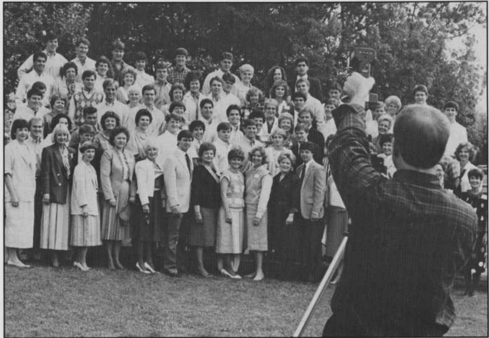
Fraternities and sororities kept photographers hopping on Mom's Day, one group after another climbing the risers on the Tri Delt lawn. Here the Delta Tau Deltas pose with their mothers.