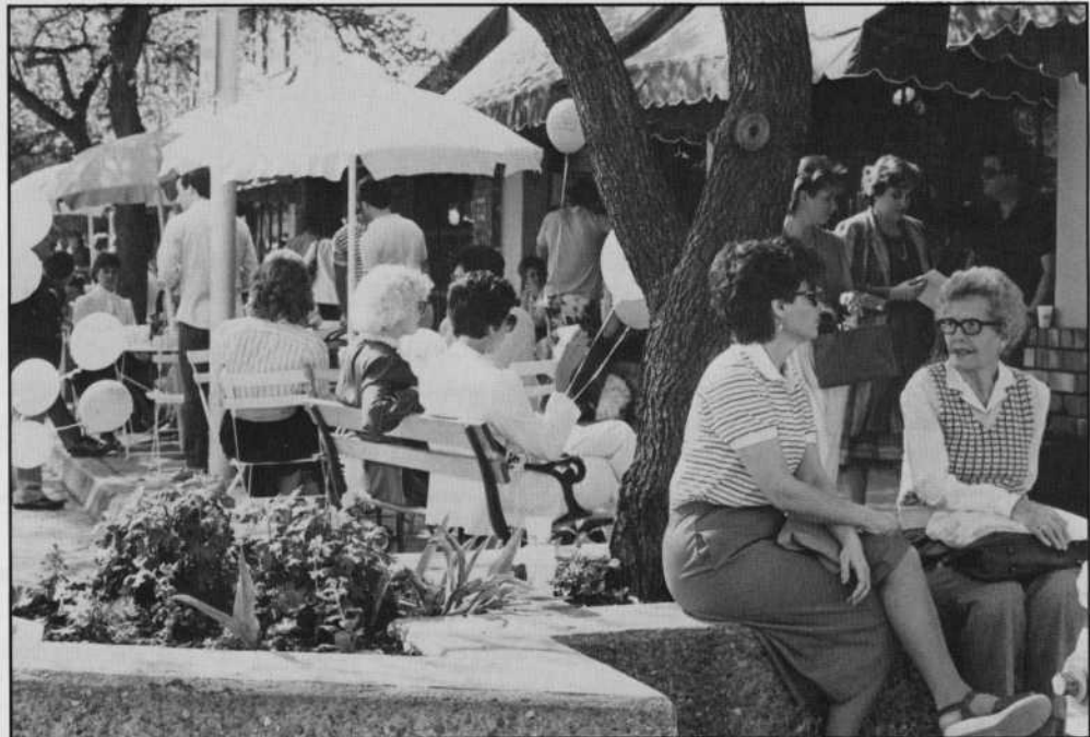
Mom in a mellow mood, checkbook in hand. What better time to replenish the college wardrobe? Umbrella tables and sidewalk benches offer momentary respite for foot-weary Sooner mothers lured by their offspring to the Campus Corner merchants' well-timed annual sale.