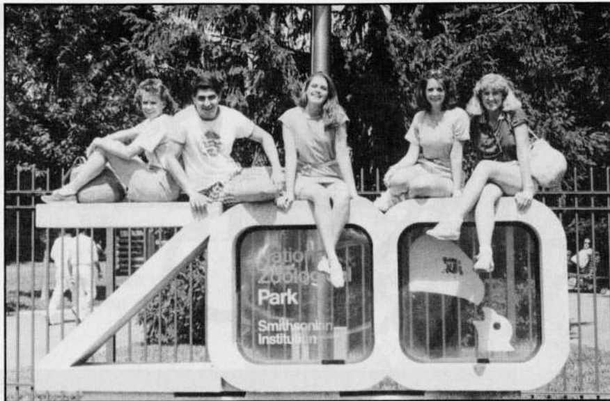
The National Zoological Park of the Smithsonian Institution was one stop in the congressional interns' effort to see everything Washington, D.C., and the surrounding area has to offer during their summer in the national capital.