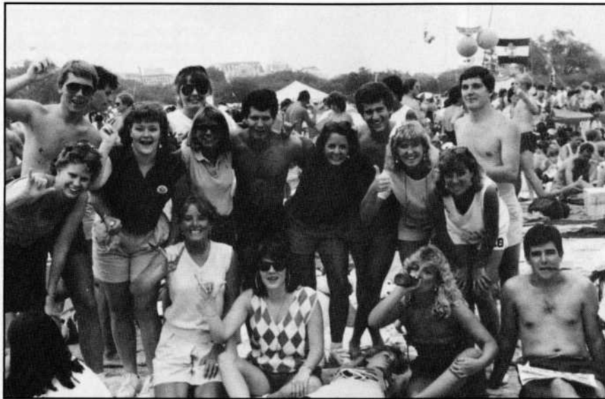
Collegiate interns from throughout the country camp out on the Capitol Mall for 16 hours with 750,000 July 4th celebrants, listening to the Beach Boys, Oak Ridge Boys and Katrina and the Waves, waiting for the fireworks to begin.