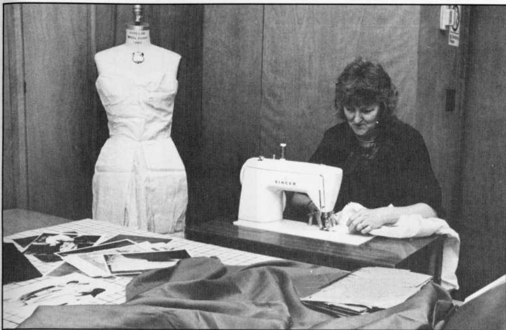
Uptegraft works on a muslin pattern for the Edmondson gown in the construction lab in OU's Burton Hall.