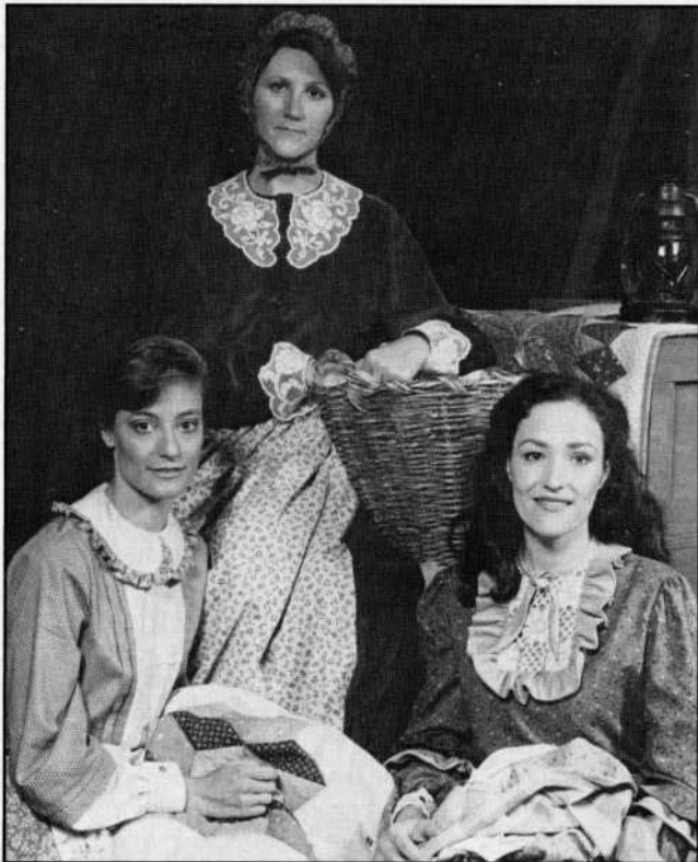
Quilting enthusiasts from central Oklahoma turned the Fine Arts Center into a gigantic patchwork "bee" for "Quilters."