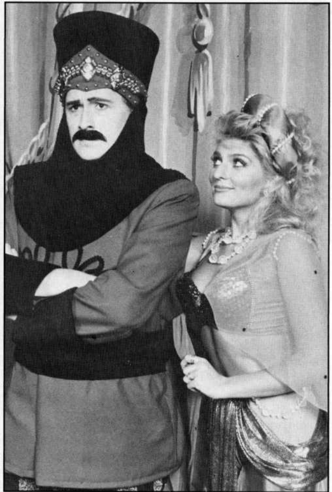
The placement of body mikes on the women's costumes for the OU musical "Kismet" required considerable design ingenuity.