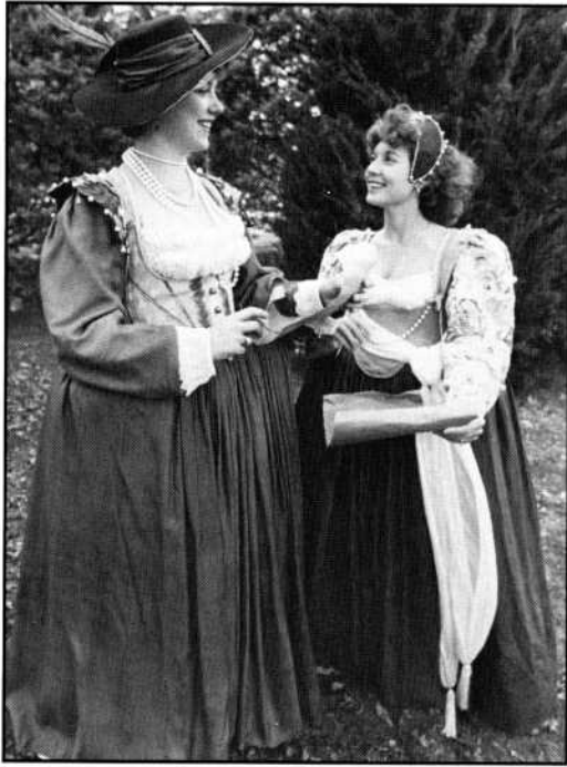
The authenticity and detail essential for television requires the individual trimming of each costume.