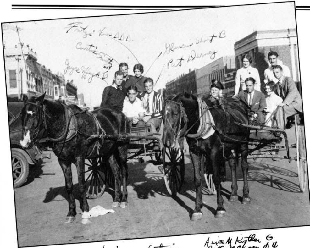
Typical scene during revolution of 1927