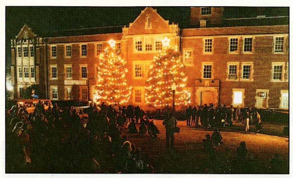
The Centennial holiday season begins on the Norman campus with the traditional tree-lighting festivities west of the library plaza, complete with carols, hot cider, Santa and his elves.

t's done every year—assembling on the Dunlap Plaza by Bizzell Memorial Library to officially usher in the holiday season by lighting the two big cedars and welcoming Santa to the campus. But this year, December 3, 1990, was special. The Centennial was winding down. Lighting the trees, like everything else during this celebration year, took on a historic significance.