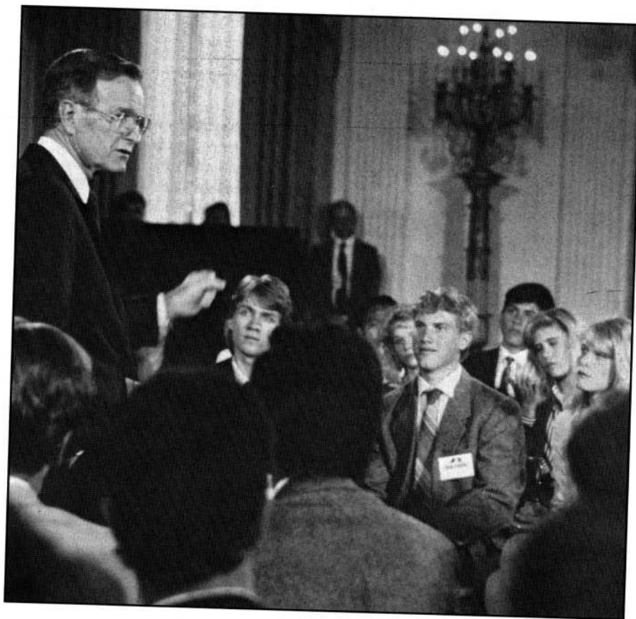
On occasion, Close Up's schedule of speakers for its Washington program ranges all the way to the President of the United States. At top, President Ronald Reagan signs autographs following a Close Up tele-conference. At bottom, the students have the opportunity to question President George Bush.