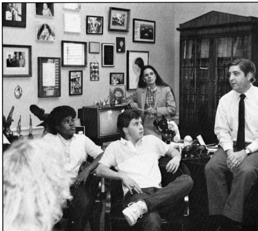
The Oklahoma delegation always has been among Close Up's strongest backers. Here Congressman Mickey Edwards meets with a group of Oklahoma City high school students who were participants in the Washington-based civic education program.