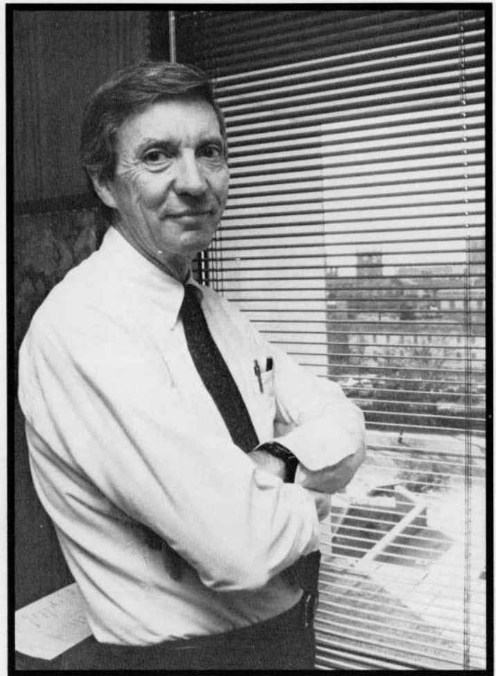
Goodman’s Sarkeys Energy Center office commands an impressive view of the campus where he has taught for nearly 25 years.

for example, could not find the Persian Gulf on a map—the area where the United States would go to war less than three years later. Forty-five percent could not locate Central America, and 57 percent could not guess the current U.S. population on a multiple choice questionnaire.