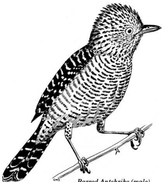
Barred Antshrike (male) from Mexican Birds , 1951 University of Oklahoma Press.