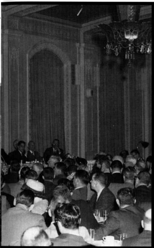
Introduction of Governor Henry Bellmon at the Forum Lecture Series, 28 January 1964.

several colleagues this morning in greeting and welcoming you to the University of Oklahoma. Like all college presidents, I do this sort of thing frequently. It has been said that the average college president probably makes as many speeches of welcome as Samson slew Philistines and, in many instances, uses the same implement.