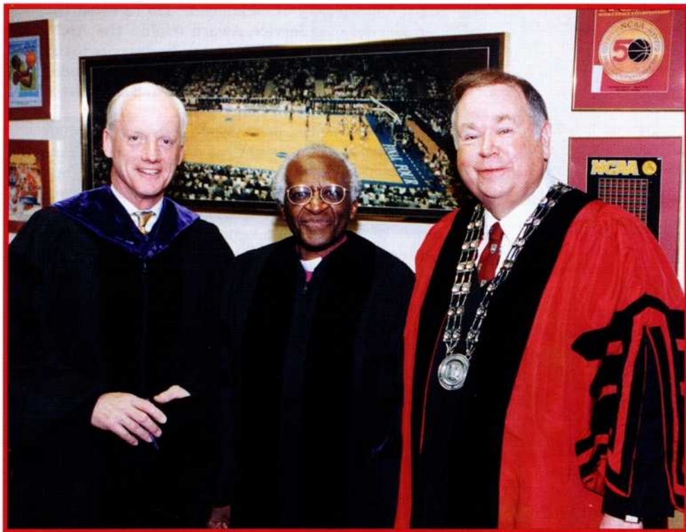
Oklahoma Governor Frank Keating, left, Archbishop Desmond Tutu and OU President David Boren don their academic robes for the convocation to award Tutu an honorary doctorate in humane letters.

Tutu lauded Gorbachev, the Russian leader who sacrificed personal power by reforming his communist government and reducing tensions with the