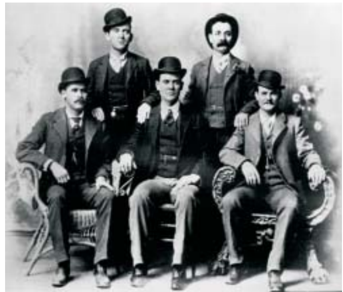
In great demand from the Western History Collections' photo archives are prints of this 1901 shot of the Hole in the Wall Gang, or the "Wild Bunch," led by Butch Cassidy and the Sundance Kid.