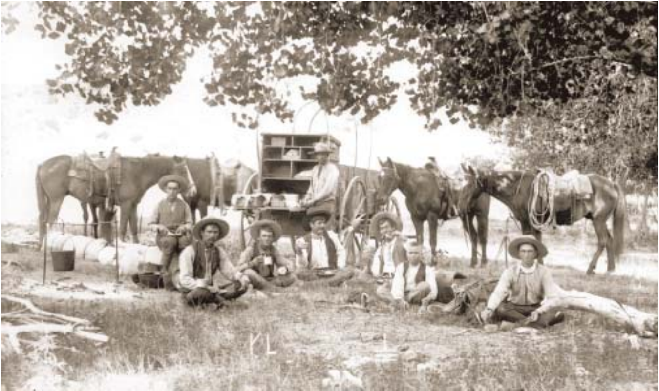
The Photographic Archives boast such gems as this gathering of “Hanging L” cowboys lounging around the chuck wagon in 1885 western Oklahoma.

Ranked today among the nation’s top five university library historical collections on Oklahoma, the Great Plains, the American Southwest and Far West, the Western History Collections is 75 years old this year. At birth, it was only a shelf full of books in a history professor’s office, but like Western expansion, time and acquisitions increased its significance.