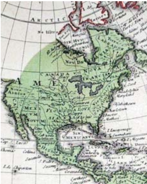
A hand-colored map of North America from the Atlas Compendiarius Quinquaginta Tabularum Geographicarum Homannianarum , published in Nuremberg, Germany, circa 1759, is contained in the Henry B. Bass Collection.