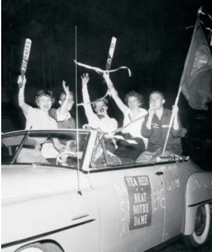
The West wasn't all cowboys and Indians; the post-WWII West was also college kids at a pep rally before the 1953 OU/Notre Dame football game, photographed in the University of Oklahoma Collection.