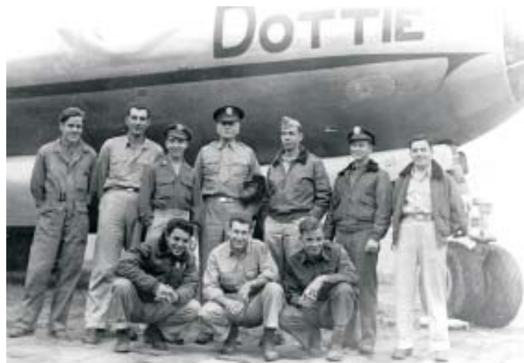
General Patrick J. Hurley, shown fourth from left with the crew of B-29 "Dottie" in Chungking in November 1944, played a major role on the world stage, notably as Secretary of War and Ambassador to China. A native Oklahoman, Hurley gave his extensive collection of papers, photos and personal belongings to the Western History Collections.