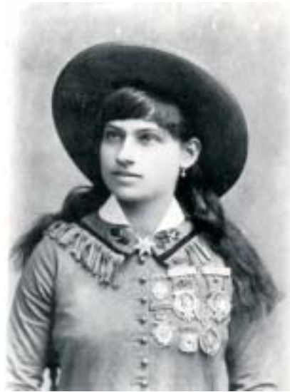
Sharpshooter Phoebe Anne Oakley Mozee, who starred in Buffalo Bill's Wild West Show as "Annie Oakley," is shown in this circa 1885 photo from the Western History Collections.