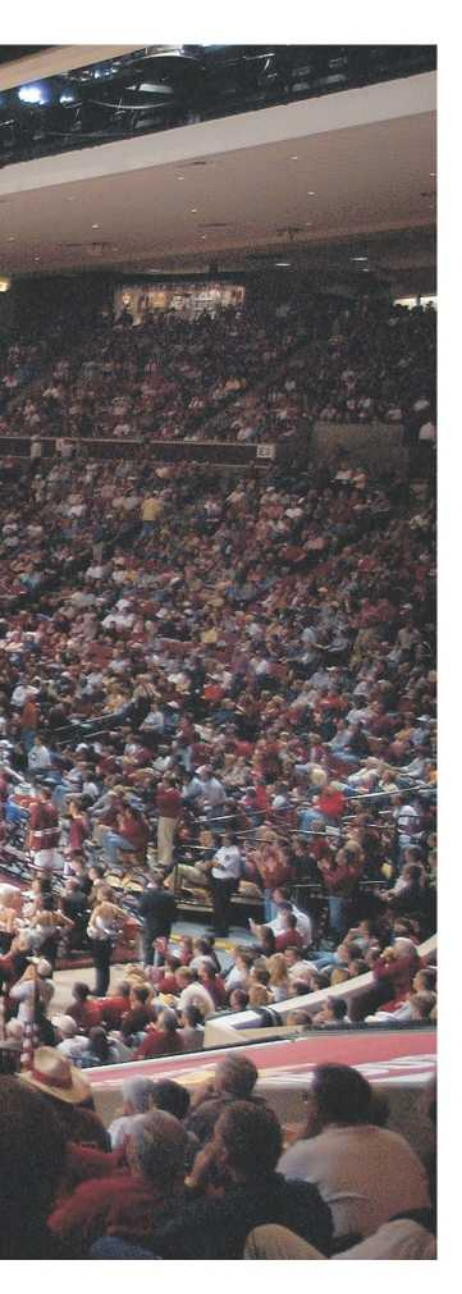
■ The new open-grid ceiling and sport lighting in the Lloyd Noble arena is more aesthetically pleasing, provides better acoustics and improves the basketball environment.