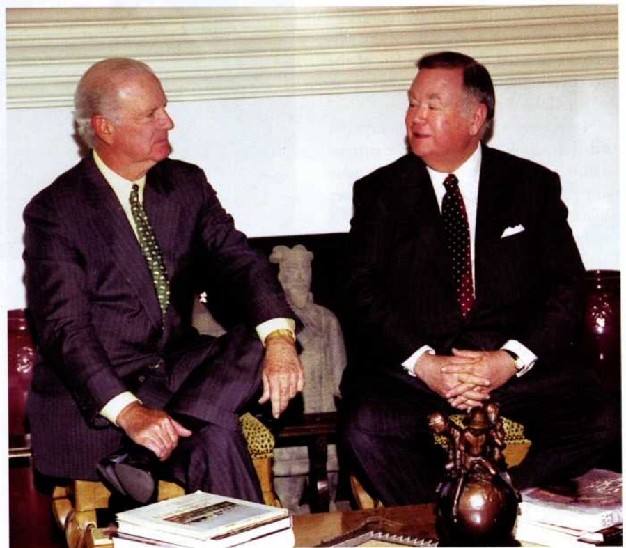
James Baker and David Boren renewed acquaintance from their federal government days in Washington, D.C., where Baker served as advisor to three presidents—Gerald Ford, Ronald Reagan and George Bush—and Boren was a leading member of the U. S. Senate.