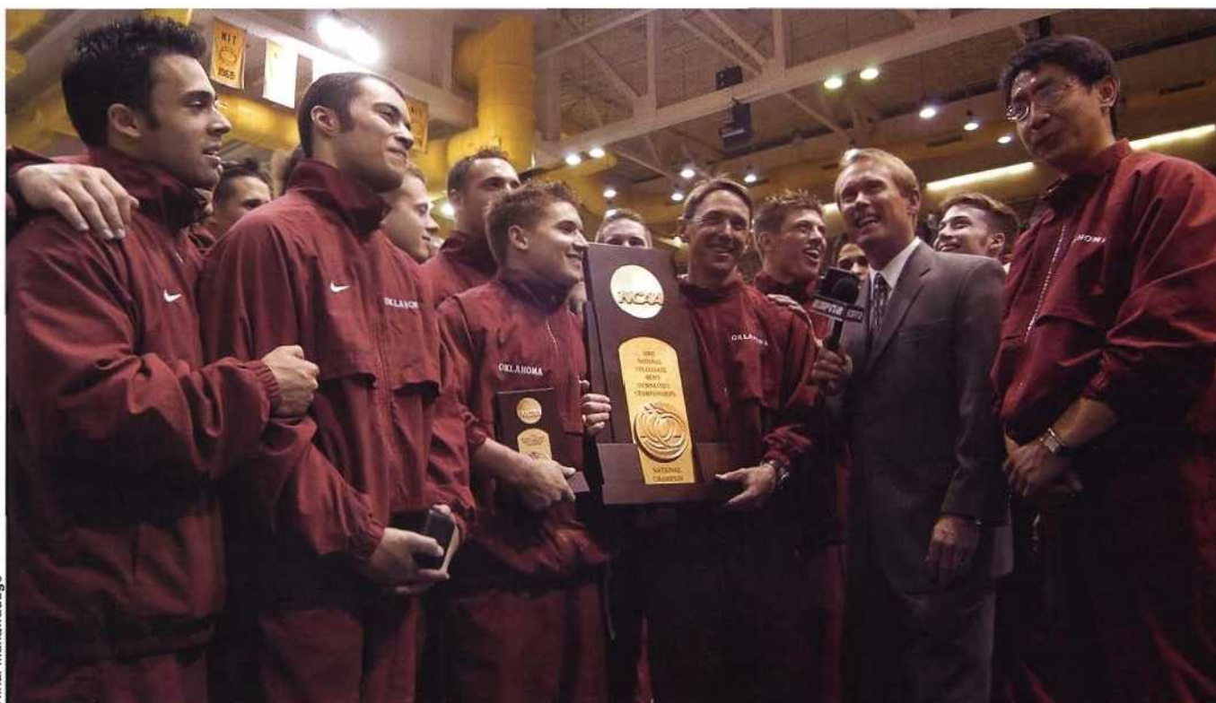
Olympic Gold Medalist and ESPN commentator Bart Conner, a former Sooner gymnast, second from right, congratulates members of the victorious OU men's team on winning their third national championship in four years.

champion, as he topped the field on rings.