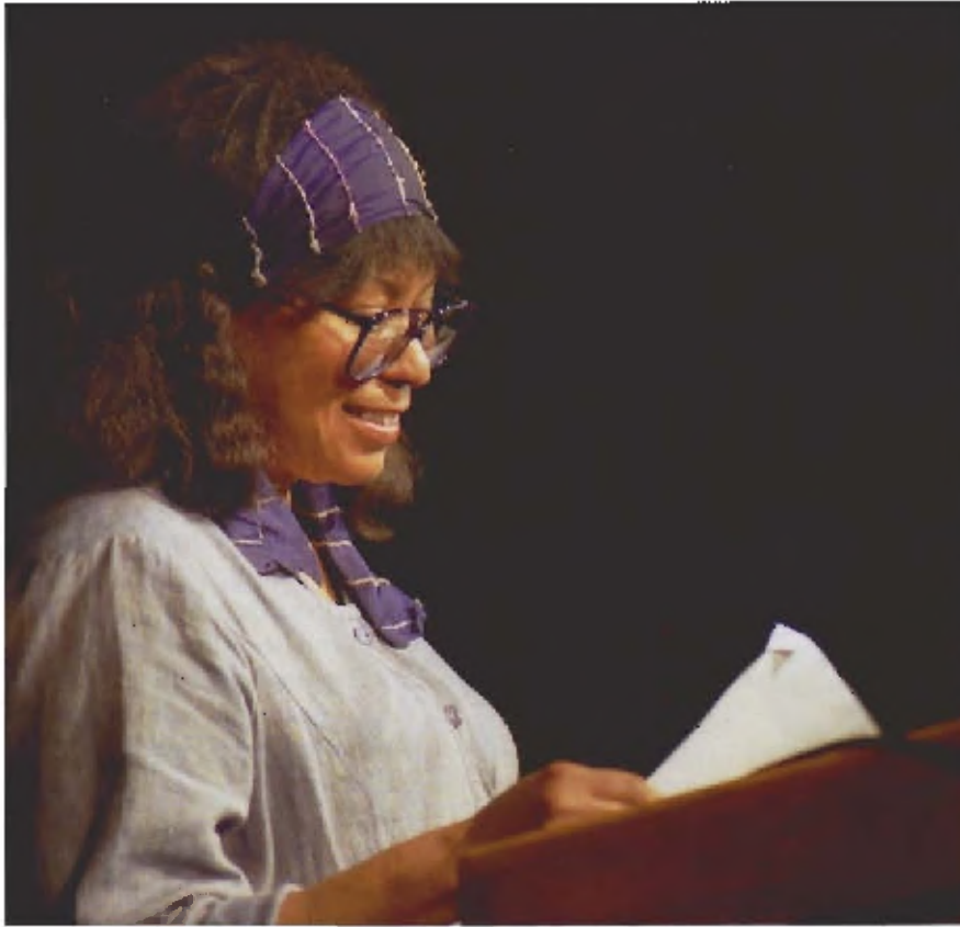
Renowned author Mildred D. Taylor swaps stories with middle school students during her visit to OU to accept the inaugural NSK Prize. Interaction between seasoned writers and young readers is a key component of the international writing award.