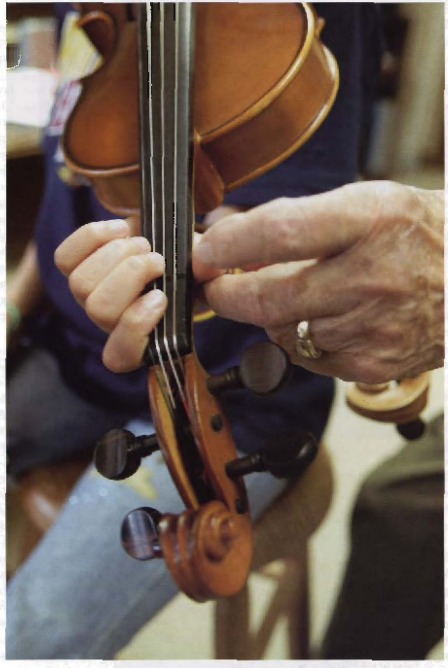
Hackler's hands have gently guided music students for more than 60 years.