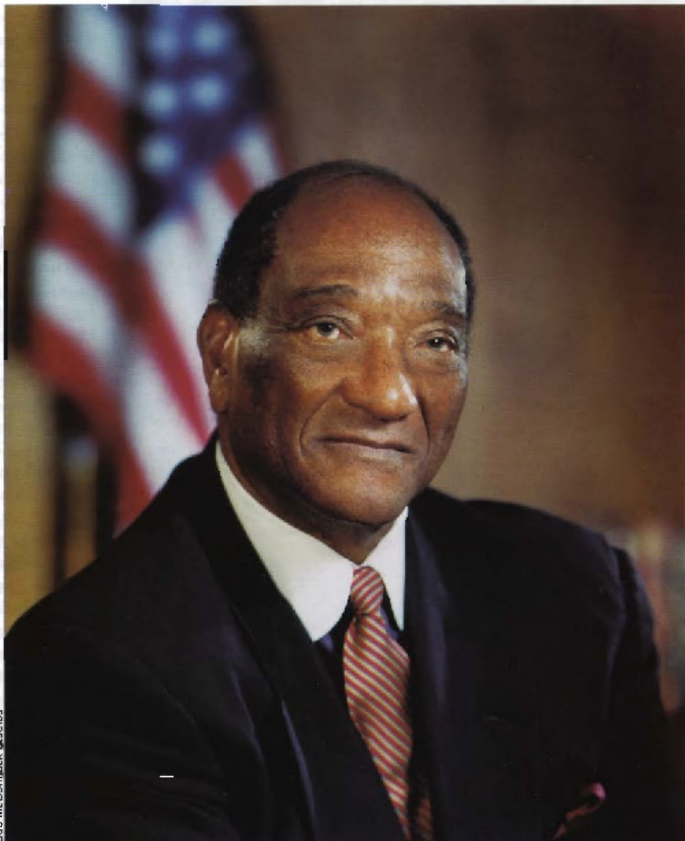
Bob McCormack Studios