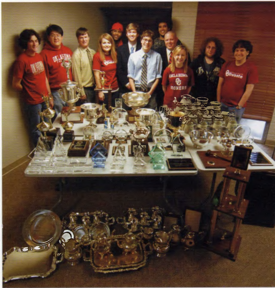
The headquarters of the OU debate program in the Honors College may soon have to add display cases aplenty to accommodate all the trophies, plaques and other symbols of their dominance that the teams are bringing back to Norman from such prestigious tournaments as the Harvard University Invitational Policy Debate and the Wake Forest University Franklin R. Shirley Dixie Classic Policy Debate.