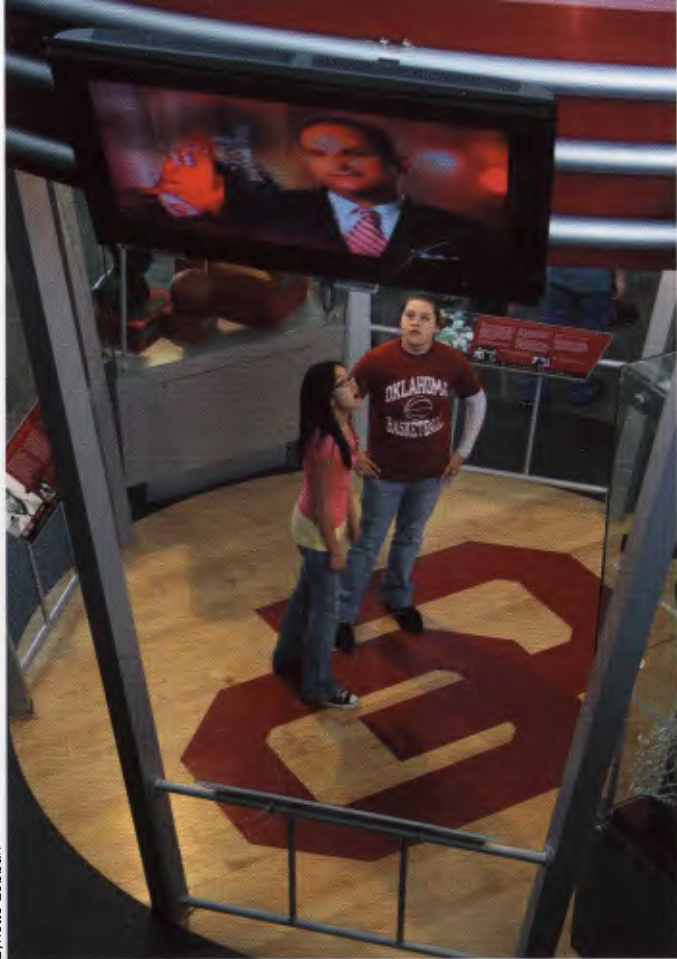
ABOVE: Big screen televisions allow visitors to relive great moments in Sooner basketball, as well as watch interviews with players and coaches.