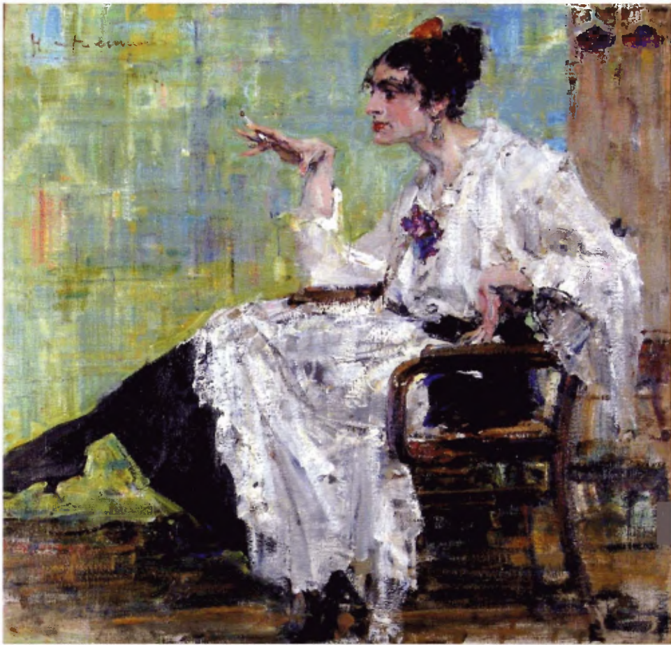
Nicolai Fechin U.S. b. Russia 1881 - 1955 Woman with Cigarette Oil on Canvas 30x31"