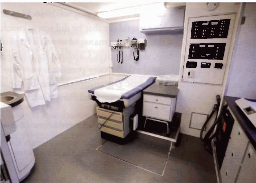
TOP: Working with programs like Head Start, the Sooner Schooner II provides well check-ups, hearing and vision tests, height and weight tests, immunizations, and other basic health requirements for children.