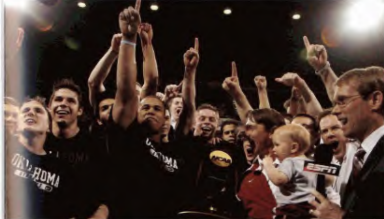
Legendary Sooner gymnast Bart Conner, far right, takes the ESPN microphone to jubilant members of OU's NCAA championship team.