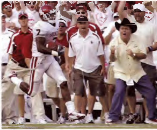
DeMarco Murray sprints toward the end zone against Texas on October 6 in front of famous supporters, professional wrestling commentator "J.R." and country music star Toby Keith, at right.