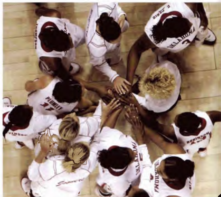
RIGHT: The camera catches a bird's eye view of the women's basketball team's huddle.