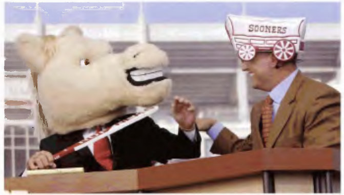
ABOVE: ESPN College Game Day's Lee Corso and Kirk Herbstreit pick the Sooners over Mizzou on October 13.