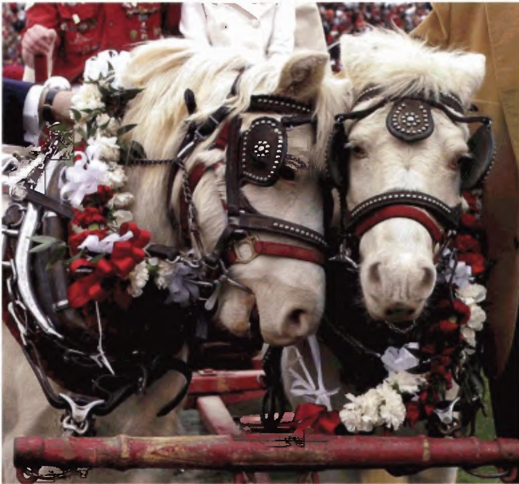
Sooner and Boomer IV made their last run during the Oklahoma State game on November 24, retiring after 15 seasons of pulling the Sooner Schooner.

Y ou see them at every sporting event, press passes clipped to their belts, overlaid with camera equipment, doggedly patrolling the sidelines, crouching precariously under the basket or climbing atop the dugout to get a better angle. While squinting through their viewfinders, they often plant themselves in harm's way as a 250-pound linebacker hurtles straight at them in pursuit of an opposing receiver headed for the end zone. They will do anything to get the shot, that one photo that will play above the fold in the Sunday paper or grace the cover of a weekly sports magazine.