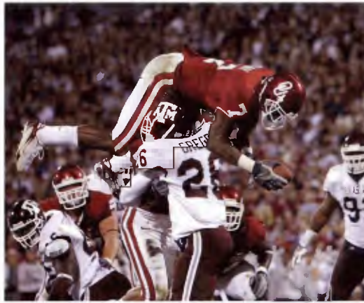
DeMarco Murray goes up and over the Texas A&M defense for a touchdown on November 3.