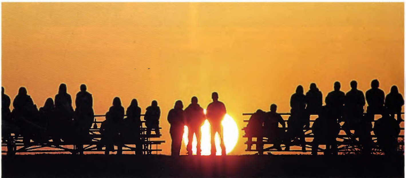
Fans look on at L. Dale Mitchell Park as the sun sets during a game against Texas on April 4.