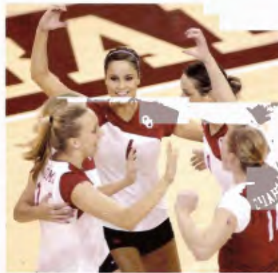
LEFT: The women's volleyball team celebrates during a match in McCasland Field House.