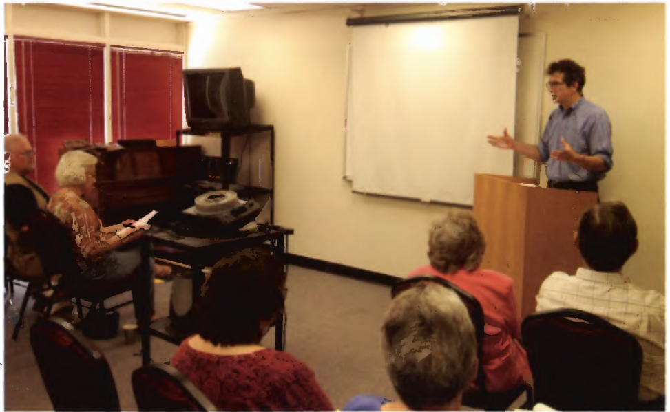
The Osher Lifelong Learning Institute has experienced a steadily increasing enrollment of over-50s, nearly 350 last year alone. Faculty line up for the privilege of teaching their special interests to older students with the leisure time, desire and enthusiasm for learning something new.