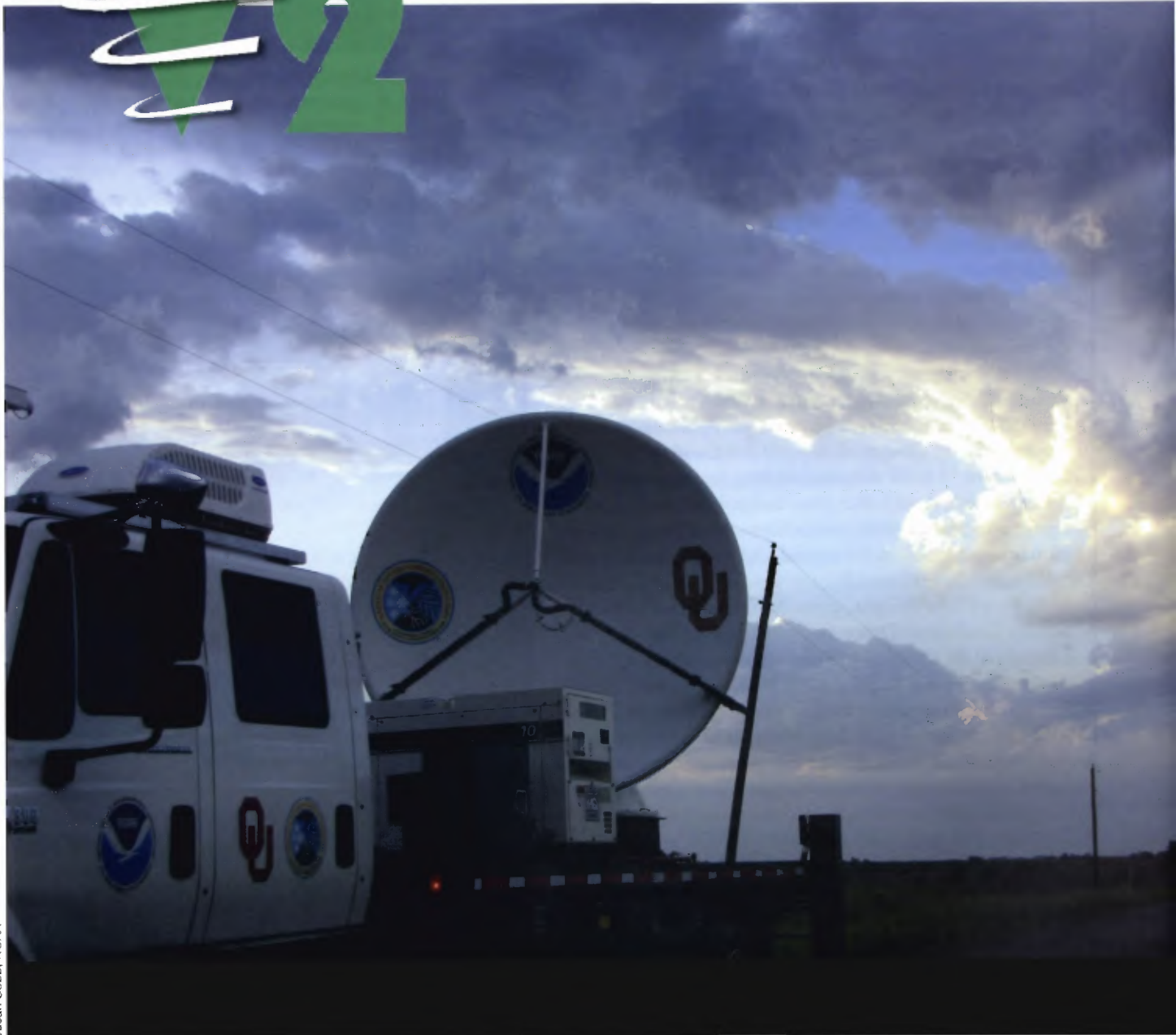
Susan Cobb, NOAA

The NOXP radar moves into position on top of a hill with no trees or buildings to obstruct its scans of a storm in southwest Iowa.