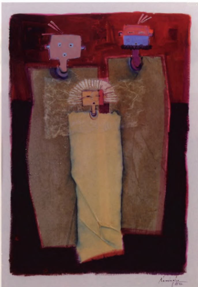
The collage, Chanters at Dusk , is one of four works, each in a different medium, by Hopi artist Dan Namingha from the Strickland Collection.