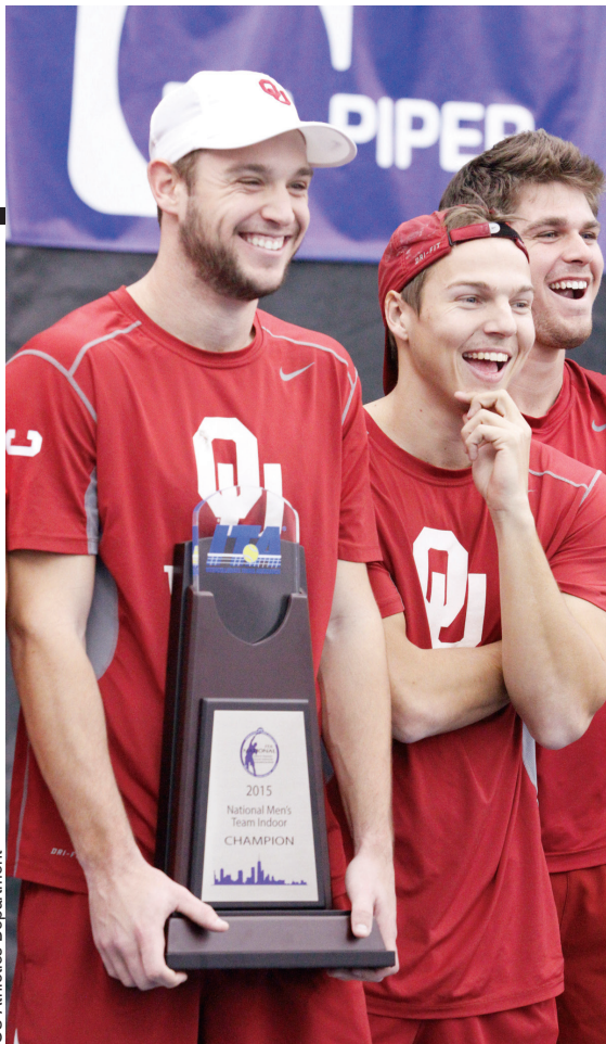
OU Athletics Department