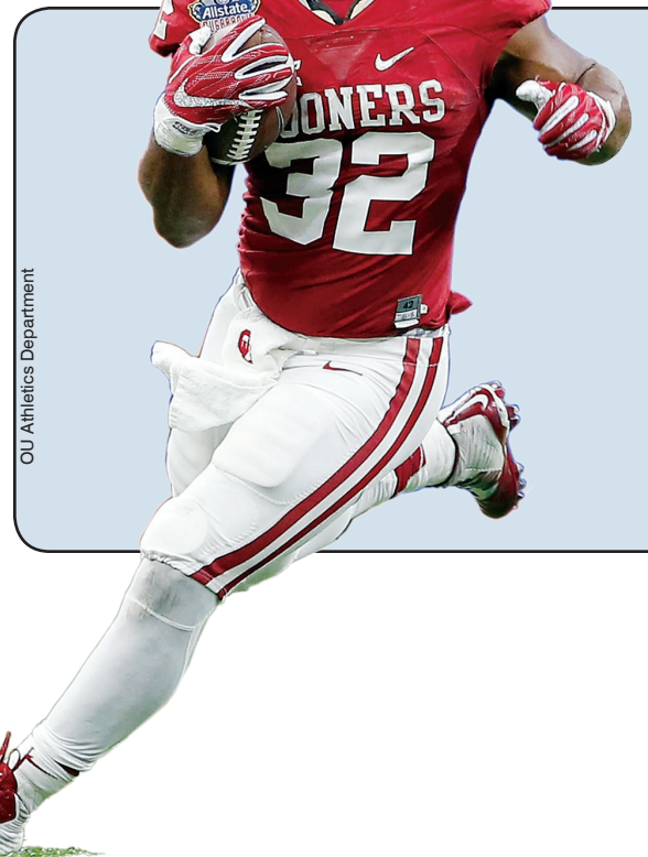
OU Athletics Department