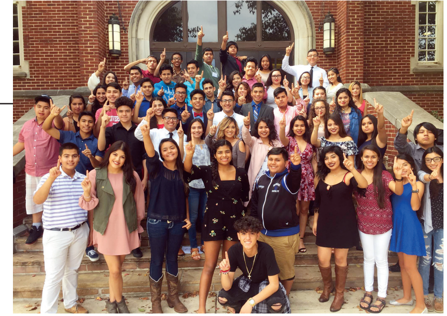
LATINOS WITHOUT BORDERS

has been named a top 50 best college for Latino students from a field of 600 institutions by Latino Leaders , a magazine dedicated to connecting and inspiring future Latino leaders. The selection was based on outstanding demonstration of student enrollment, faculty environment and recruitment, diversity-driven strategies and programs directed to Latino student populations. Enrollment of Latino freshmen at OU has increased by 18 percent in the past two years.