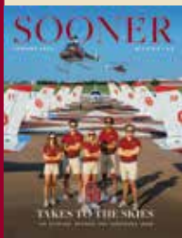
ON THE COVER: Students from OU's top-ranked School of Aviation show off the university's new helicopters and fleet of Piper single-engine airplanes. Story on Pg. 2.