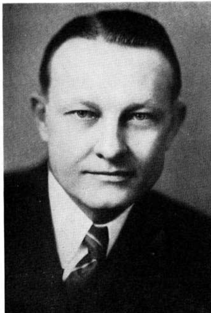
Senator Josh Lee, '17as, who tells in this article some of his objectives in his term as United States Senator which started in January.

Already widely known as a popular orator as a result of his term in Washington as Fifth District Congressman from Oklahoma, Senator Lee is constantly in demand for addresses at national meetings of various kinds. Prevention of war is one of his most popular themes.