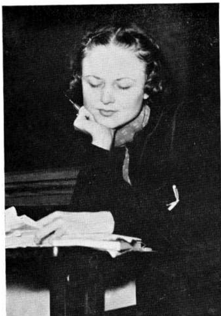
Multiply this co-ed (immersed in enrolment problems) by 6,244 and you have the number of students enrolled this fall.

U NIVERSITY enrolment this fall had reached the impressive record total of 6,224 by mid-October, an increase of 488 over the total on the corresponding day of the previous school year.