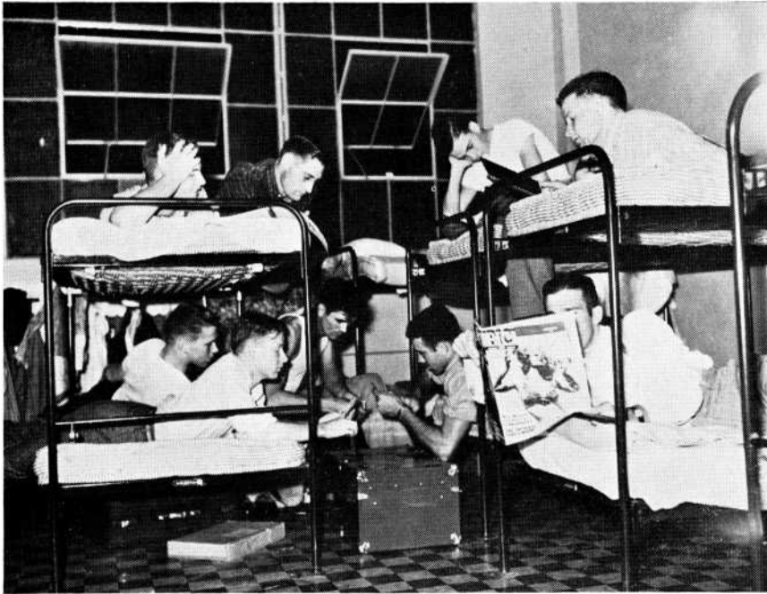
New this fall is the co-operative dormitory in the west wing of the Stadium, housing 90 men students inexpensively. There is little privacy, as you see, but the quarters are clean and convenient. Nice on football Saturdays.

be all right for Cadet Rice to quit military training, but that he could not continue it unless he took it in good faith and would accept an army reserve corps commission at graduation.